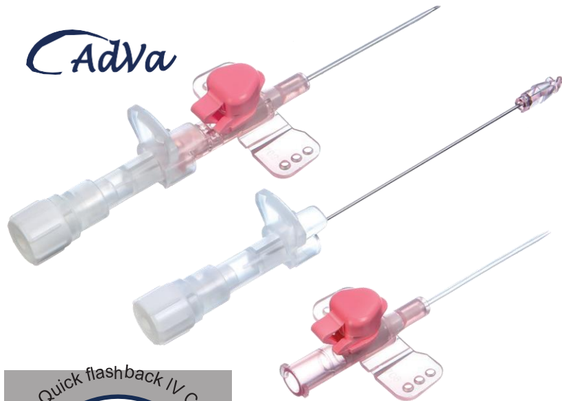
Quick flashback IV Cannula